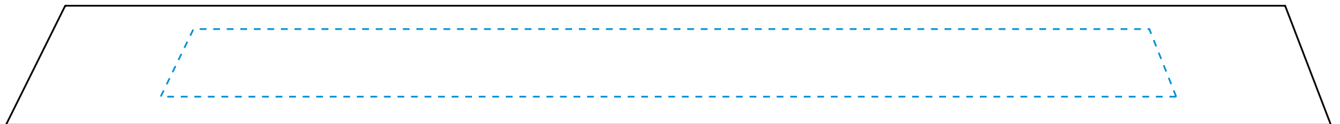
BASE ETCH AREA